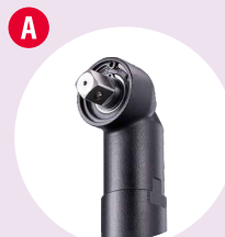
All Metal Angle Head