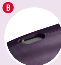
Adjustable High Precision Shut-Off Clutch